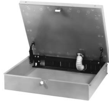
Model TR-3-1620 Test Head Kit